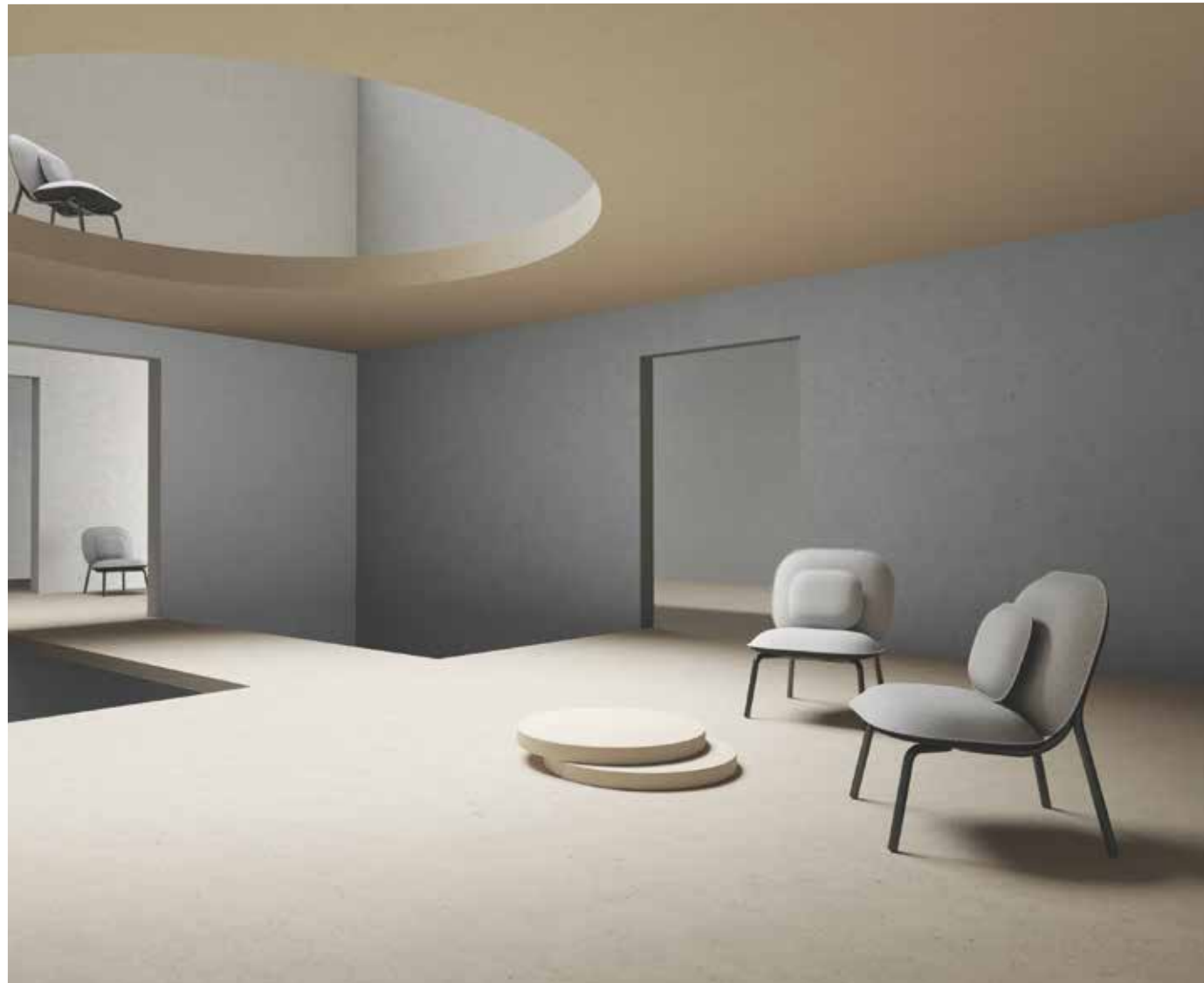
TASCA LOUNGE CHAIR TO-1911 / 1912-1902